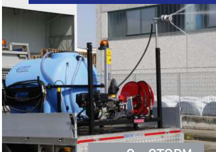
S - STORM