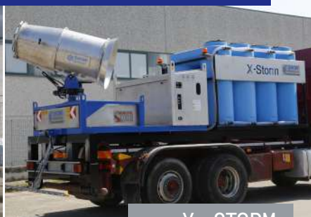
X - STORM